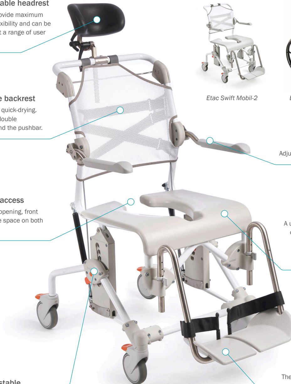
Etac Swift Mobil Tilt-2

The gently curved footplates provide instep and arch support, ensuring comfort, stability and relaxation.