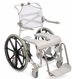
Etac Swift Mobil 24"-2