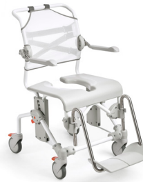
Etac Swift Mobil-2

Easy to adjust to different fixed seat heights, without using tools.